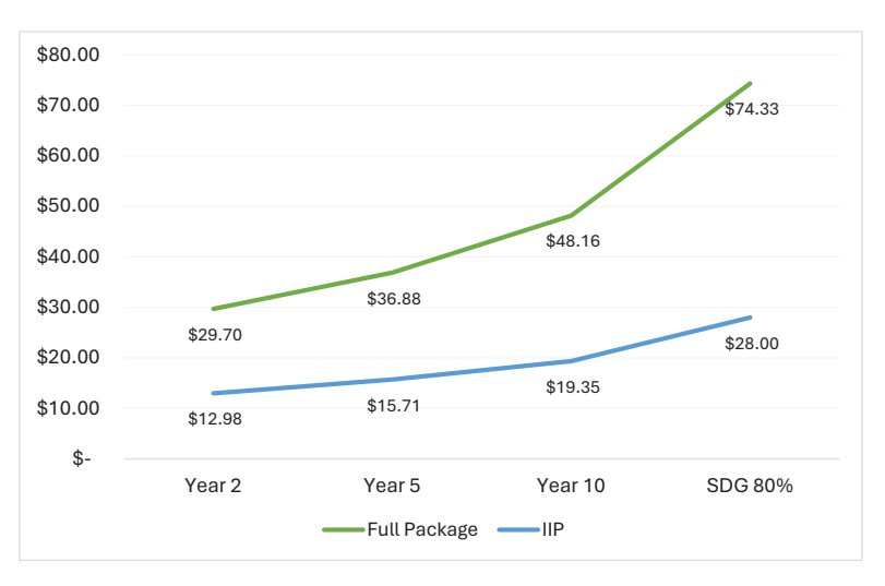
Figure 1. Estimated Cost of the Full and Immediate Implementation Packages Along the Universal Health Coverage Target of Achieving 80% Coverage. Abbreviations: SDG, Sustainable Development Goal; IIP, immediate implementation package.

Most interventions in the full district EPHS (76%) are